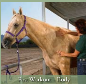
Post Workout - Body

On hot, humid days, Vetrolin ® Liniment can be mixed with water to help cool down your horse.